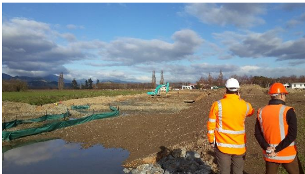
Photographs 5 & 6: Before and After Formation of Borck Creek

Meeting the Tasman District Council Engineering Standard of providing 250mm of freeboard also proved difficult to achieve along the full length of the widening due to batter height variability between cross-sections (due to ground variability along the old Waimea Flood Plain). A conservative approach was taken to generally provide the full capacity at the cross section with low points in the batters or install bunding to fill in old flood channels.